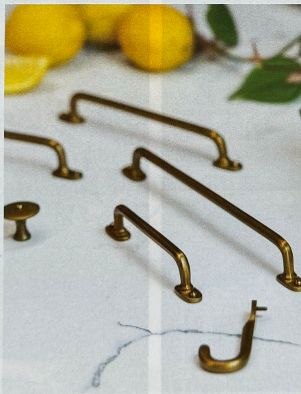
Marcelle Collection | Modern Matter modern-matter.com

Anthology is crafted of American-made solid brass and is offered with a palette of different colored leathers. Each piece comes in both standard and custom sizes.