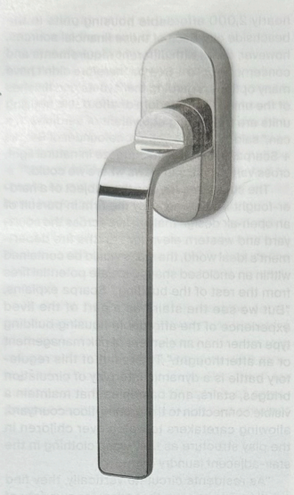
Zai Collection | Ento ento.it

Inspired by the intricate geometric patterns in the fence surrounding Gramercy Park, these handle sets incorporate knurled textures and dark metals. The collection includes tubular handle sets, mortise entrance trims, and door pulls. Baldwin also carries cabinet hardware.