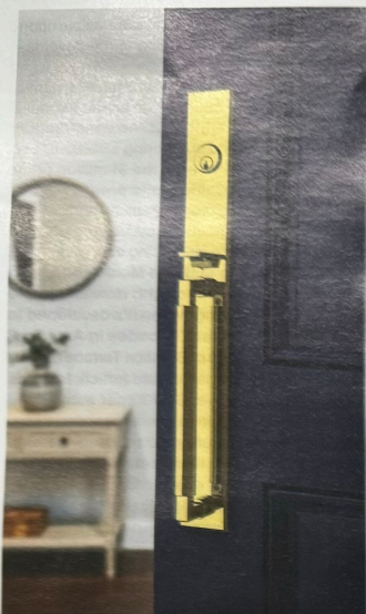
Gramercy Handle Set | Baldwin Hardware baldwinhardware.com

The details that matter when it comes to the design experience. RCO