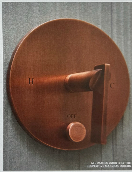
Keaton Tub & Shower Diverter Plate | Newport Brass newportbrass.com

Using exposed screws and a hand-forged finish, New York-based Float Studio and Modern Matter created the Marcelle Collection as an homage to bespoke vintage hardware.