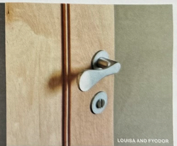
LOUISA AND FYODOR

Case studies and products. Read on page 33.