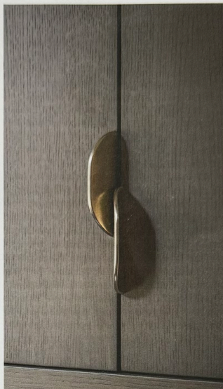
Phases Collection | Rocky Mountain Hardware rockymountainhardware.com

Designed by Neri & Hu, the Zai Collection features a flat metal profile with a gentle radius bend that fits the curvature of the hand. This simple form is applied to a lever door handle, door pull, and window handle, all fabricated in various metallic finishes.