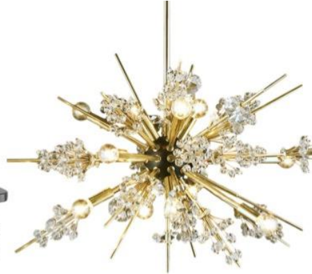
Lobmeyr Auditorium chandelier, $19,290; kneenandco.com.