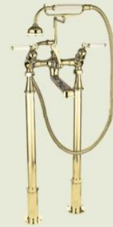
Drummonds The Mull bath and shower mixer, $2,915; drummonds-uk.com.

The freestanding tub filler has become the center of attention.